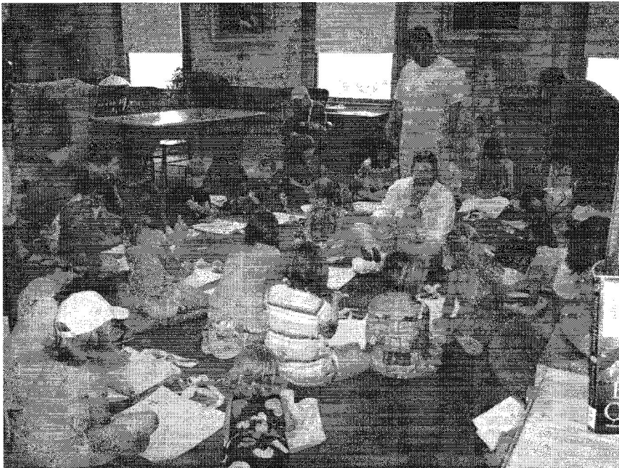
ABOVE: Henniker kids decorate their canvas book bags during an activity sponsored by the Friends of the Tucker Free Library.

Several projects were on the table for discussion, including insulation and window repairs. As we discussed further energy saving measures, representatives from PSNH approached the Board and offered to complete an audit of our lighting system. The goal of the analysis was to determine the energy usage of the lighting infrastructure and then recommend an alternative system which used less energy. A summary of the completed projects follows: